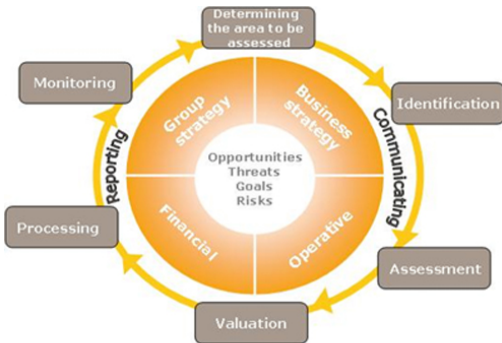
A model for coordinated risk management

The principle governing the risk management policy is illustrated above. The risks that may interfere with the achievement of the objectives in the sector in question are identified and assessed as part of business operations planning. Risk management is also an integral part of the Group strategy process.